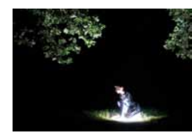
13. Lina Fesseler Untitled , 2012