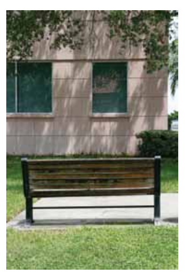
8. Marina Amrehn Untitled, 2011