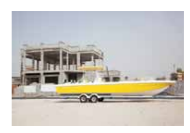
3. Natalie Isser Desertland , 2012