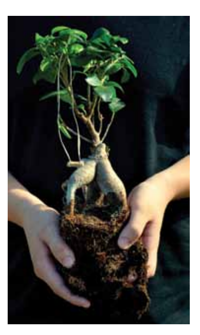
3. Kerstin Hufer Untitled , 2012