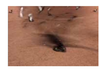
7. Magnus Wiedenmann Untitled , 2012