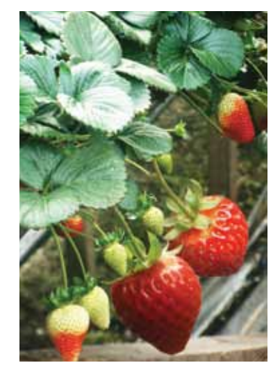
2. Daniela Brill How to make a strawberry the size of a watermelon, 2012