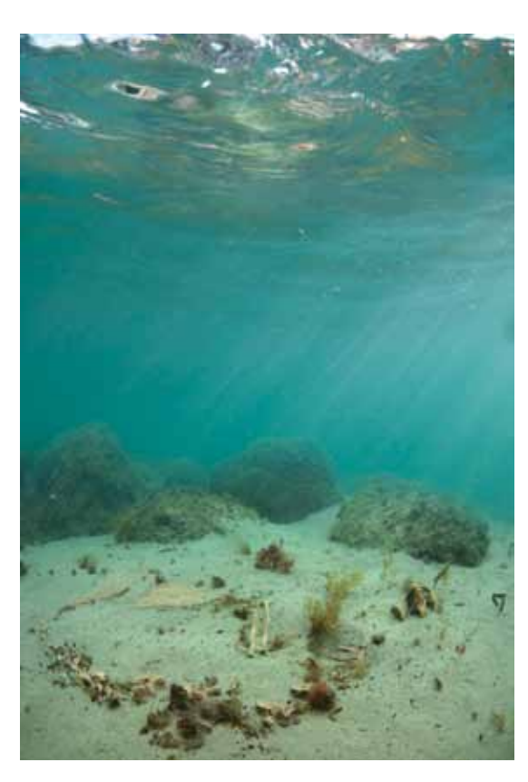
ry. In such context nature and function of photography must be critically re-thought.

Today's concept of fiction relates to the conflicts of visual representation and the impact of digital imaginary onto collective conscience. New technological tools, social networks and the massive circulation of images in the Internet change the sense of the canonic axis of photography which is truth, identity and memo-