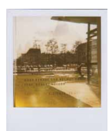
2. Jakob Lauer Single-layered complexity #1, 2010