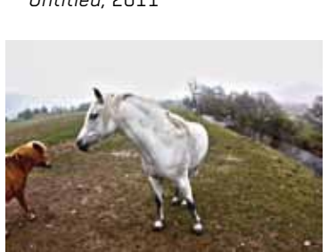
9. Anna-Maria Kiosse Two horses , 2012