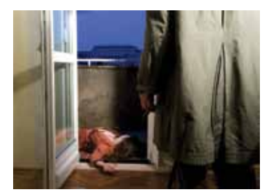
11. Eszter Galambos Untitled , 2011