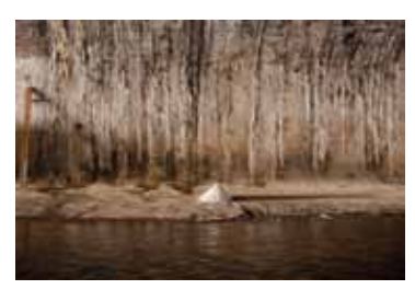
7. Céline Struger ма́ло / but there has to be more, 2012