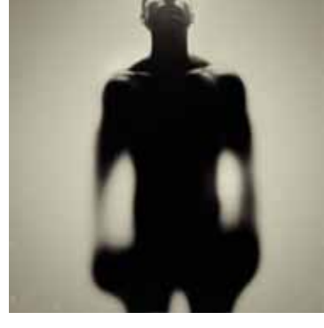
4. Attila Kozó Epilogue , 2012