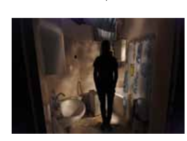
9. András Törcsi Untitled , 2012