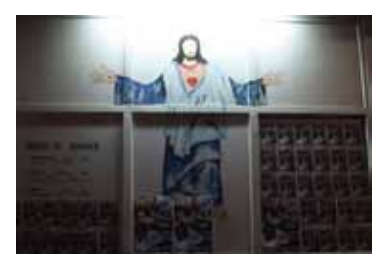
8. Déni Irs Jesus de rue de Vaseline, 2012