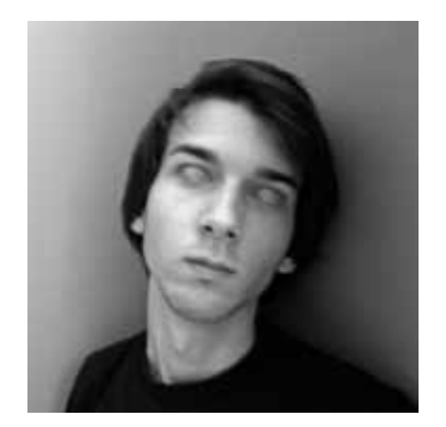
3. Panna Donka Untitled , 2011