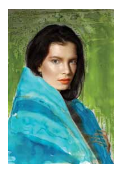
1. Wanda Martin Untitled , 2012