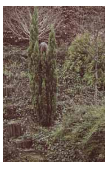
5. Vesna Faassen Untitled selfportrait , 2011