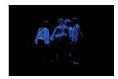
5. Katri Naukkarinen Flock , 2010