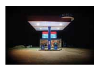
4. Lasse Lecklin Eko, Greece from the series Places to Stop, 2012