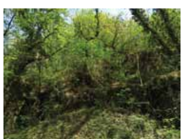
6. Laurence Schoen Lonely Paradise, 2012