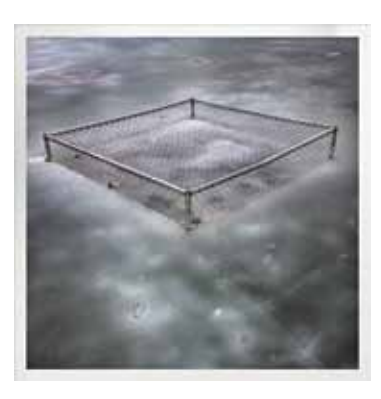
12. Simon Braun Untitled. , 2011