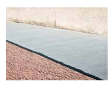
5. Sven Weber Plattenweg , 2012