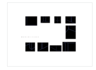
6. Pawel Szostak Exhibition , 2012