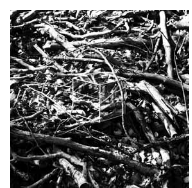
10. Marina Gärtner Untitled , 2012