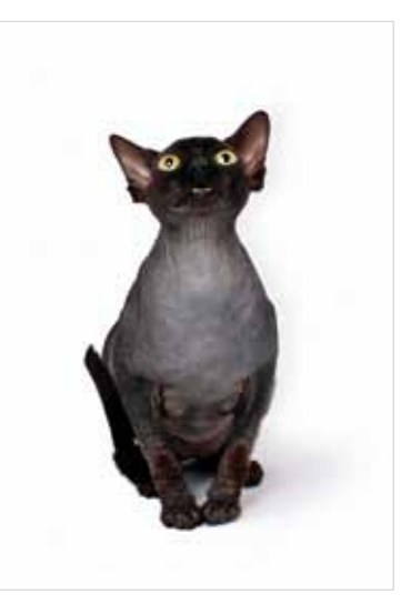
7. Hilde Lenaerts Cat , 2012