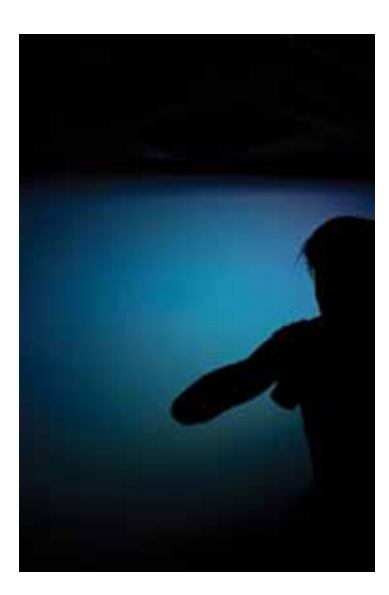
14. Benedikt Eisenhardt Blue , 2012