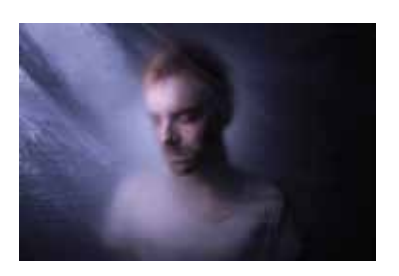
10. Réka Hegyháti Untitled , 2012