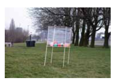
6. Ben Van den Broeck Balloons , 2012