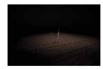
10. Petra Waldek Untitled , 2012