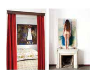
3. Salvatore Elefante Ximena , 2011